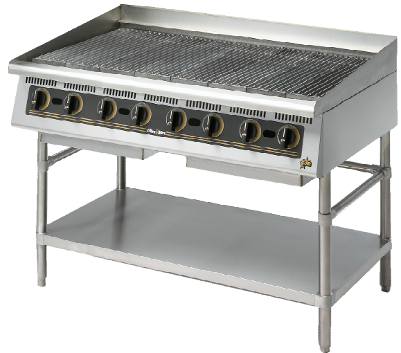
Model 8148RCB Shown with Optional Mobile Equipment Stand