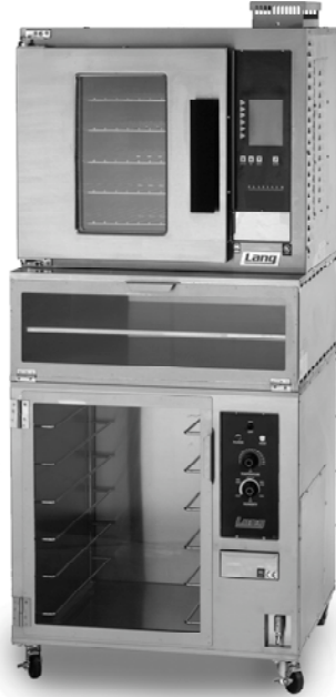
Model MB-PT shown