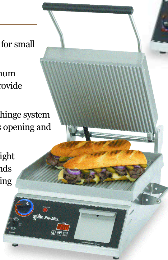
14" grill with aluminum grooved surface and timer CG14T