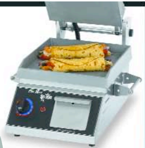
10" grill with aluminum smooth surface GR10