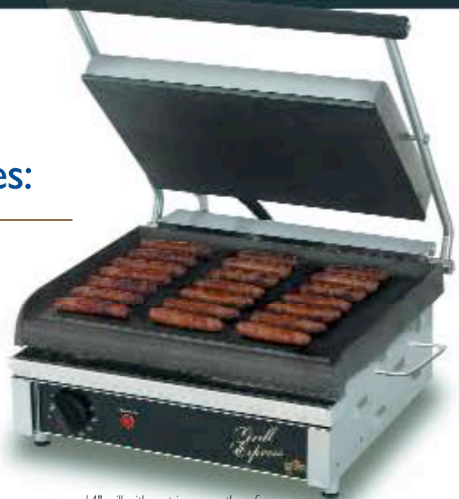
14" grill with cast iron smooth surface GX14IS