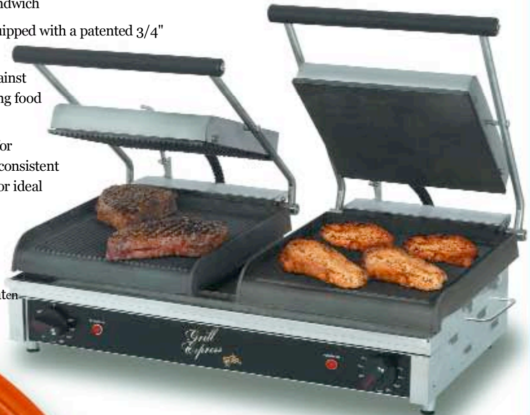
20" grill with cast iron grooved surface (left) and smooth surface (right) GX20IGS