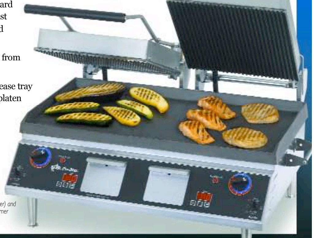
28" grill with cast iron smooth (lower) and grooved (upper) surfaces and timer CG28ITGT