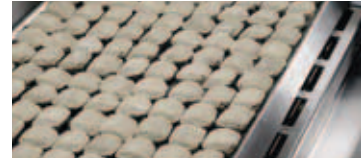
Optional Ceramic Coal on Stainless Steel Coal Screen