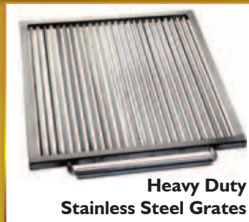
Heavy Duty Stainless Steel Grates

Standard rod spacing (5/16") works well for all-around cooking. "Fish" spacing (3/16") offers added support for delicate products.