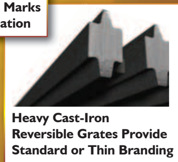
Heavy Cast-Iron Reversible Grates Provide Standard or Thin Branding