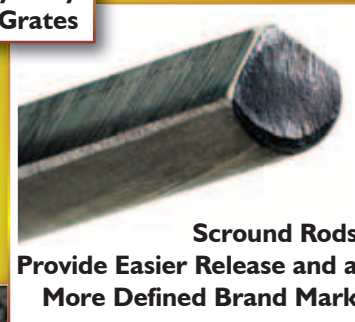
Scround Rods Provide Easier Release and a More Defined Brand Mark