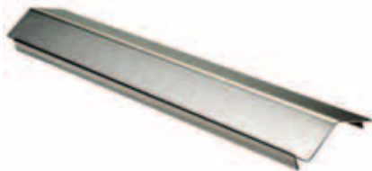
Standard Stainless Steel Burner Radiants

Build your Series 600 with one of these three options, or convert in the field. Any Series 600 charbroiler can easily be converted without tools, from Stainless Radiant to Cast Radiant or Ceramic coal in less than 15 minutes.