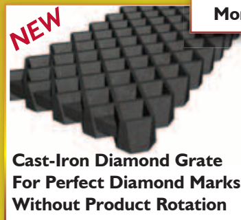
NEW Cast-Iron Diamond Grate For Perfect Diamond Marks Without Product Rotation