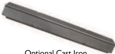
Optional Cast Iron Burner Radiants